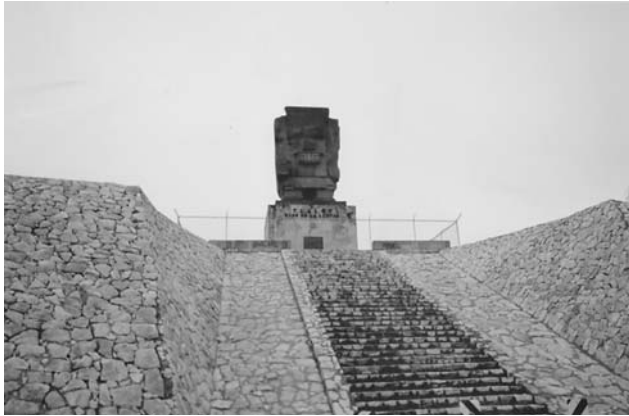
Statue of Tlaloc