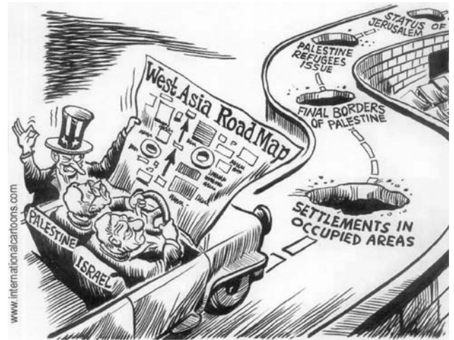
West Asia Road Map