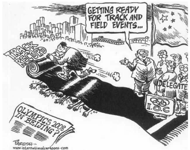
China in 2008 Cartoon (used by permission of www.InternationalCartoons.com )